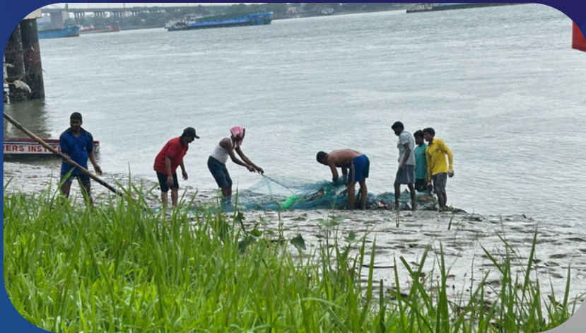
Pictured above: Setting up surface skimming net