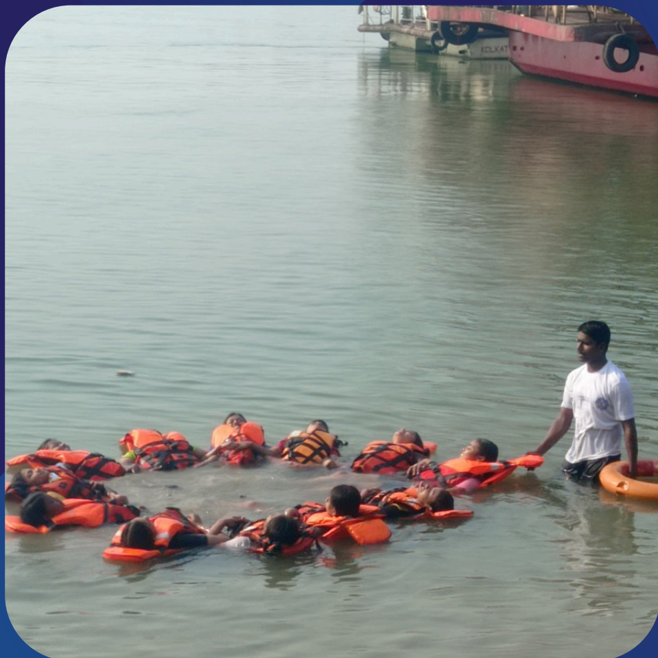
Pictured above: Life saving lessons Pictured to the left: Kayak control and floating training