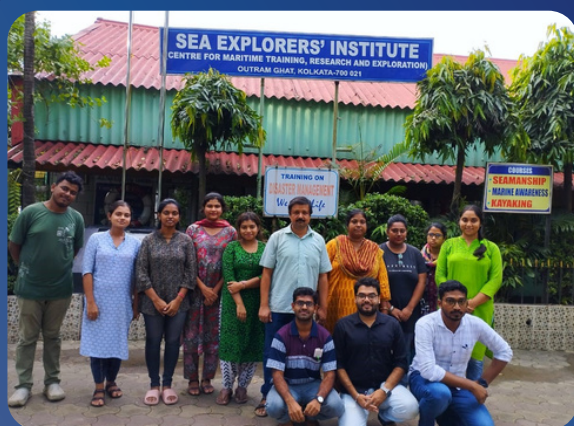
Pictured to the right: Batch 47 of the Environmental Analyst Class