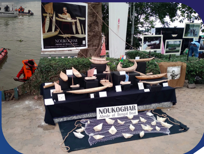
Pictured below: Antique vessel stand, displaying historic seafaring boats