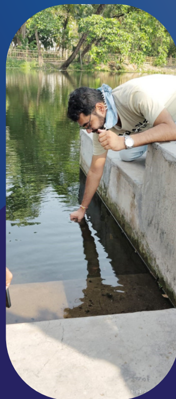
Pictured above: Water sample collection