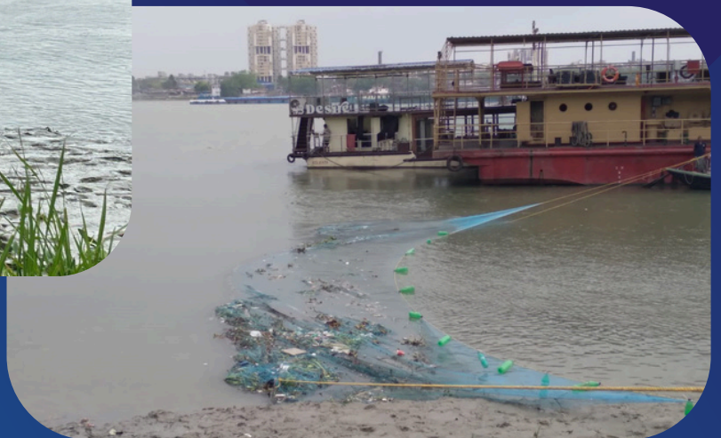
Pictured to the right: Surface net catching waste along the river