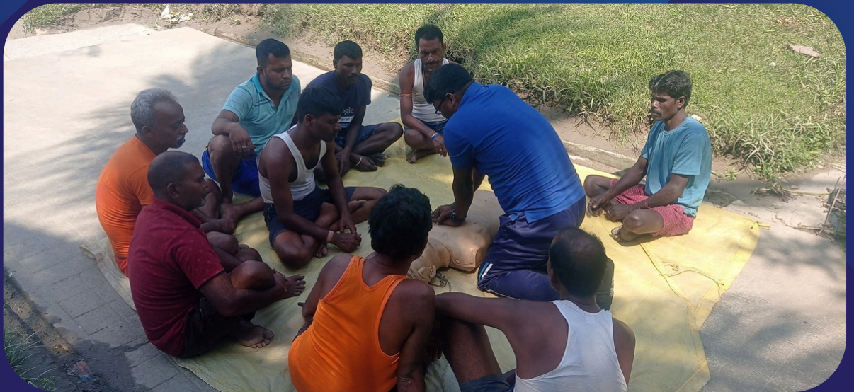
Pictured above: Life saving techniques demonstration Pictured below: Surface cleaning technique demonstration

11 local men from various ghats were trained to act as First Responders in case of emergency and prevent deaths from drowning. This was done in collaboration with Kult X.