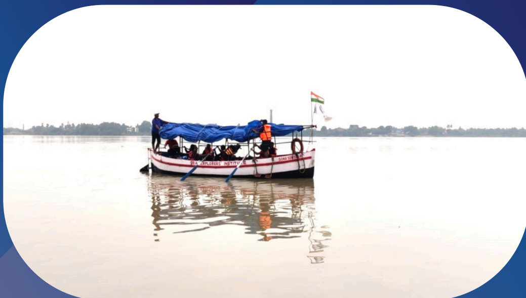
Pictured to the left: Batch 66 leaving for Uluberia