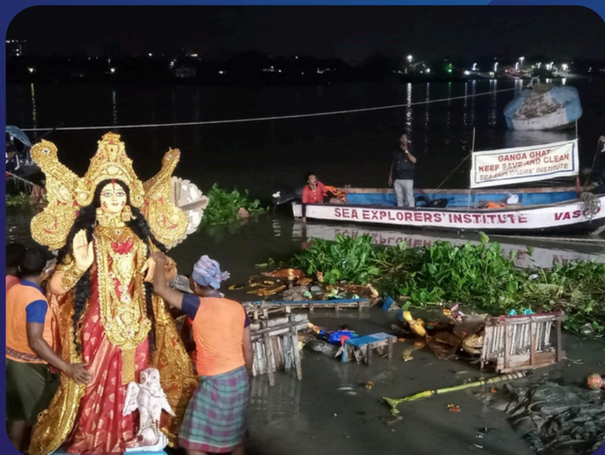
Pictured: SEI vessel on watch with life savers, during Durga Puja immersions

Life savers (5) kept vigil till midnight over the ghats of the river Ganga on rescue boats on the occasion of Durga Puja festival, Immersion duty, between 13 th and 15 th of October, 2024.