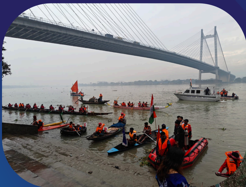
Pictured above: Different types of vessels on show

There were nearly 30 exhibits in the Boat Show.