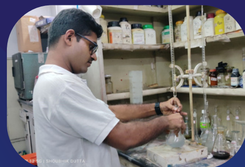
Pictured above: Chemical Analysis of water samples taken